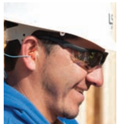
Worker using recommended PPE when working with nail guns: hard hat, safety glasses, and hearing protection