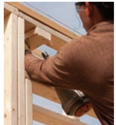
Nail penetration through the lumber is a special concern where the piece is held in place by hand