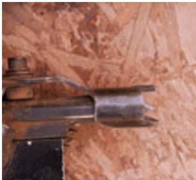
Contact safety tip