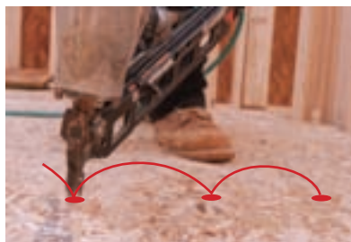
Bump firing or bounce nailing is using a nail gun with a contact trigger held squeezed and bumping or bouncing the tool along the work piece to fire nails. Red dots show path of motion.